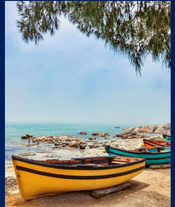
Ian Baderhorst Unsplash