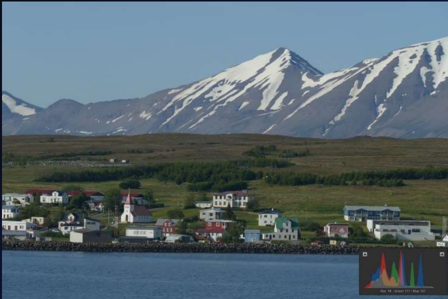
Colours seem dull out of camera