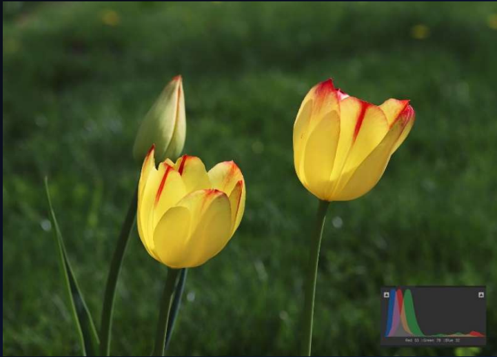
Out of camera