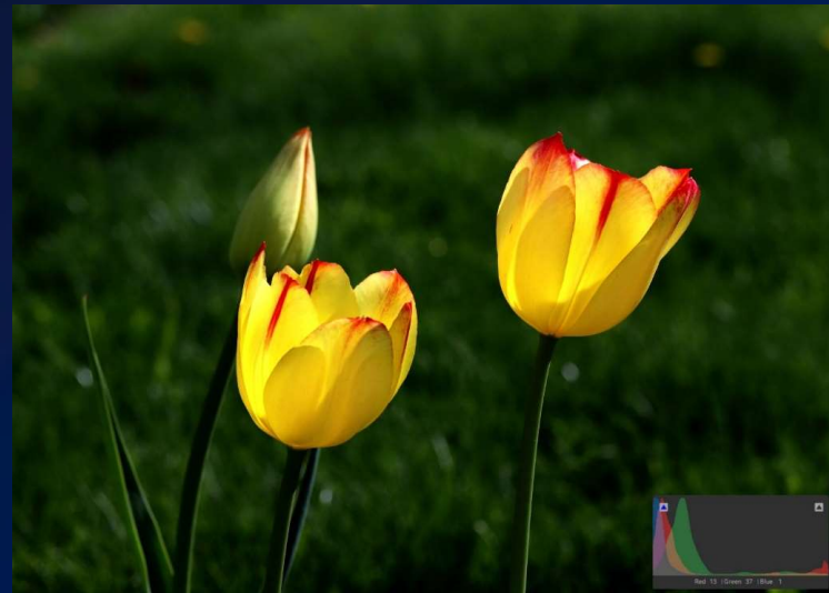
Using black/white controls