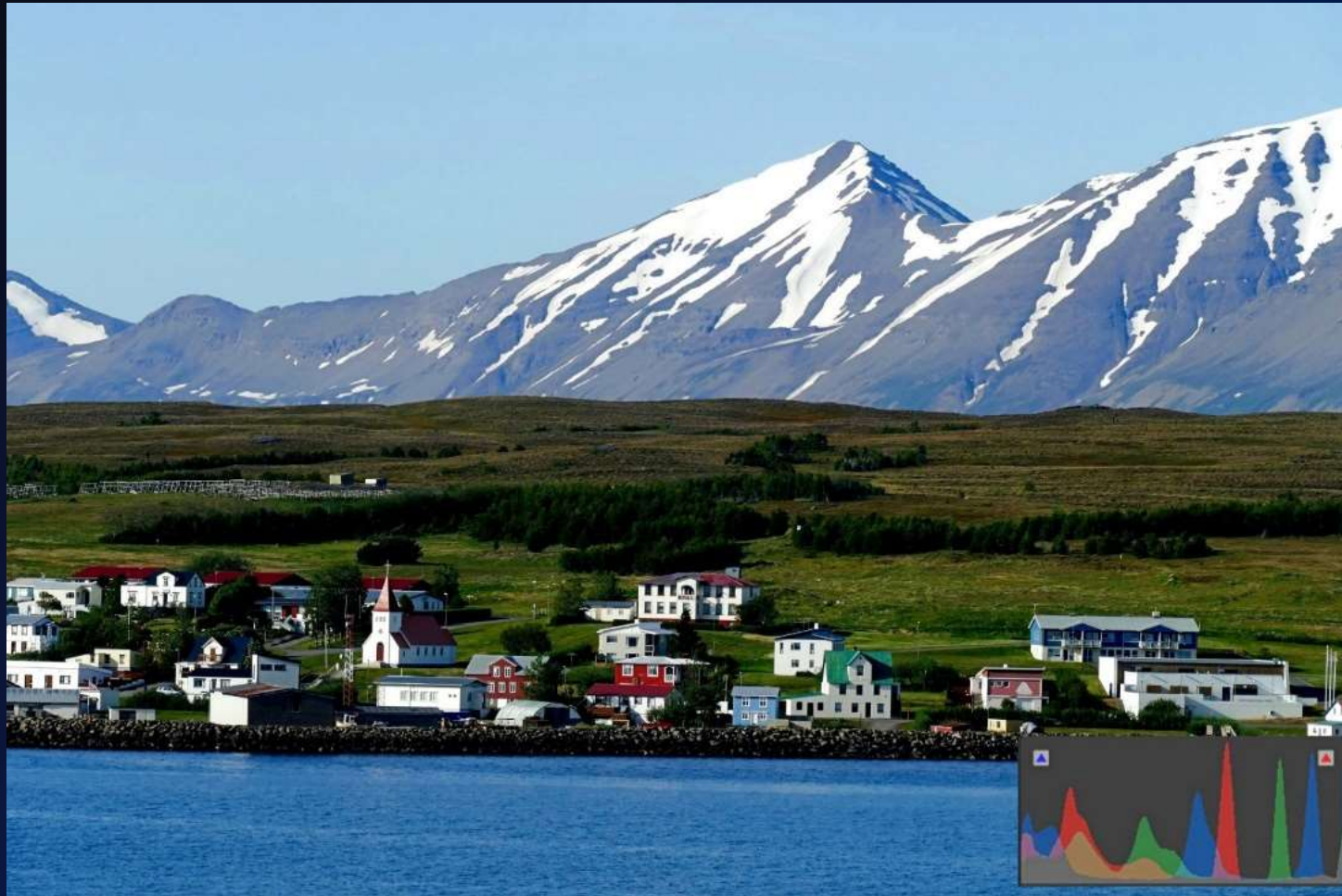
Contrast enhances but is natural looking