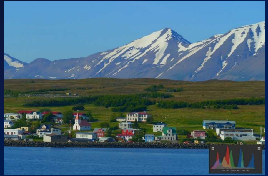
Colours appear unnatural with saturation